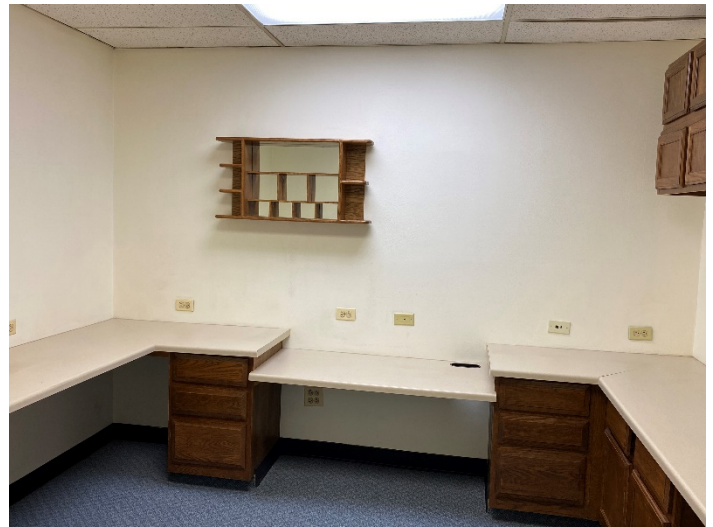
Typical Office & Admin Area