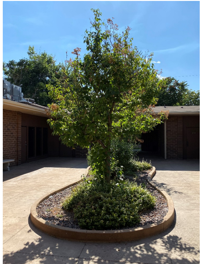
Monument Sign & Building Courtyard