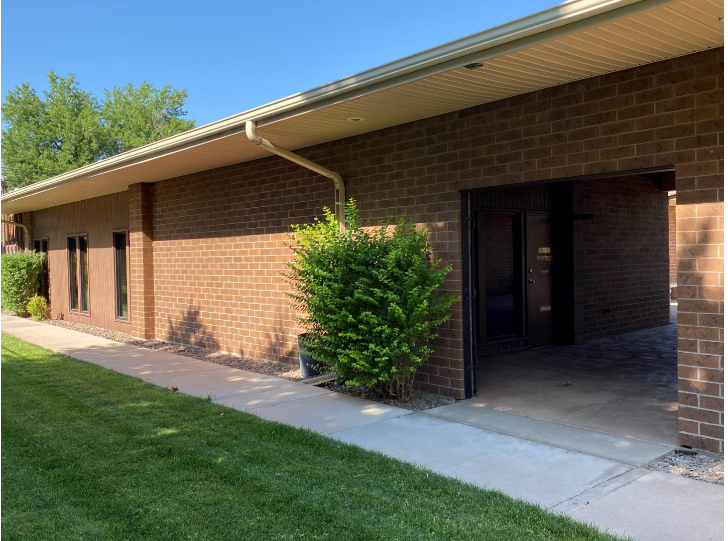
Office Condo - Exterior

7861 W 38 th Avenue, located in the heart of “Tree City USA”, was constructed in 1981. Zephyr Center – Building 2 has a single-tenant commercial office condominium with ample, free on-site parking for owner, employees, and visitors. The proximity to amenities on both 38th Avenue & Wadsworth Boulevard provides tenant’s employees great access to restaurants, breweries, hotels, etc.