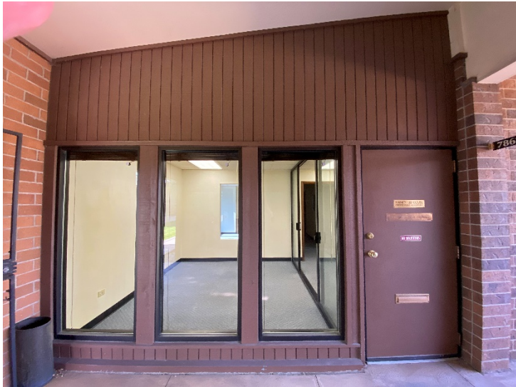
Main Entry - 7861 W 38th Ave