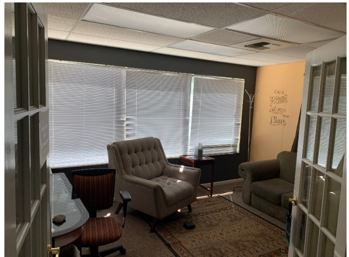
1 st Floor Office / Meeting Room