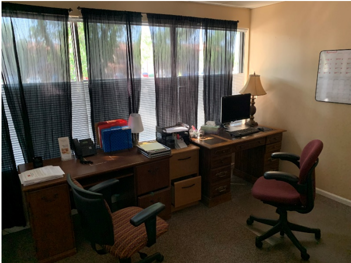
4-desk Hoteling Area