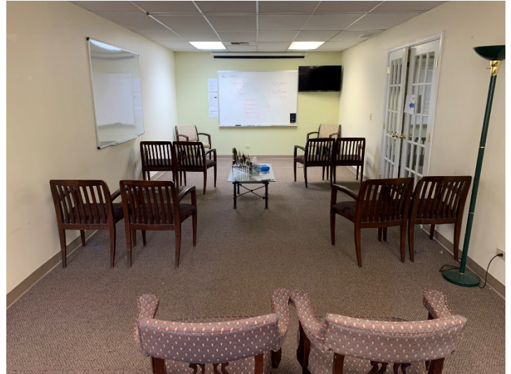
2 nd Floor Conference/Training Room