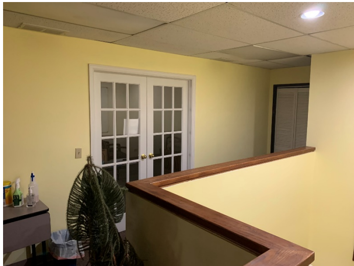
Upstairs Landing Area